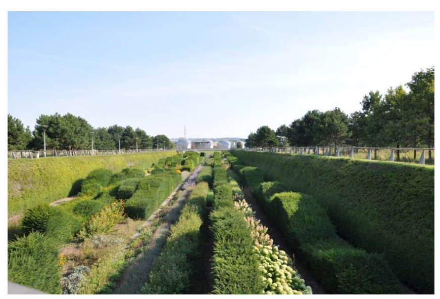
Fig. 2. Thames Barrier Park - "green dock"